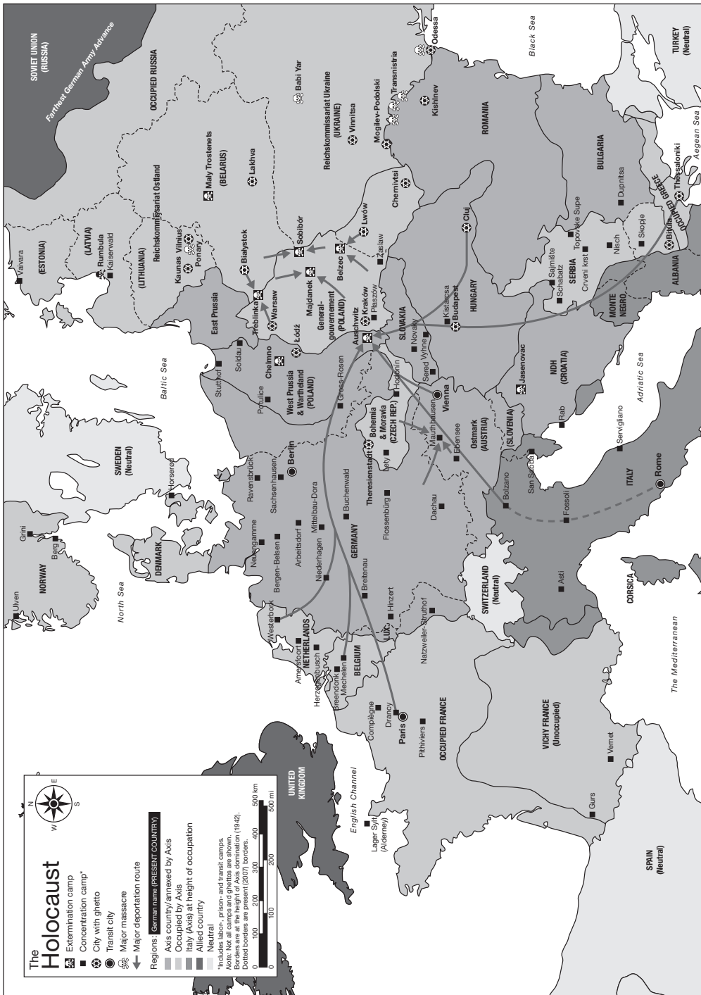
Map 6.1 The Holocaust in Europe Source: Map by Dennis Nilsson/Wikimedia Commons.