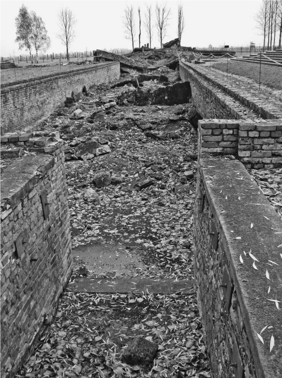
Figure 6.5 The haunting ruins of the Crematorium III death factory at Auschwitz II-Birkenau outside Oswiecim, Poland, dynamited by the Nazis just before the camp was liberated by Soviet soldiers in January 1945. The view is looking down the steps which victims, mostly Jews transported from all over Europe, were forced to tread en route to the undressing room within. They were then murdered in an underground gas chamber (at top left, not clearly visible), and cremated in ovens under the (now-collapsed) roof-and-chimney complex at the rear. More than one million children, women, and men – overwhelmingly Jews, but also Roma/Gypsies and Soviet prisoners-of-war – were murdered at Auschwitz-Birkenau. The site has become synonymous with the Jewish Holocaust and modern genocide.