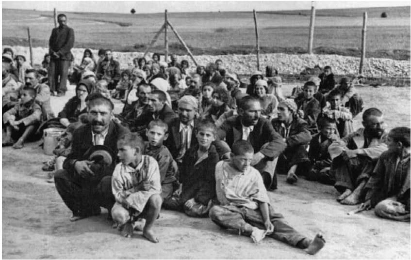
Figure 6A.4 Roma interned in the Nazis’ Belzec death camp in Poland. Of all demographic groups in Europe, the Roma and Sinti – long known as “Gypsies” – were probably the only ones destroyed in the Nazi holocaust in about the same proportion as European Jews. Roma and Sinti remain vulnerable across much of Europe, from Ireland in the west (where they are known as “Travellers”) to Romania in the east. They are widely depicted as a shiftless and/or criminal element, and are liable to discrimination, harassment, and vigilante violence. 53

The grim phrase “lives undeserving of life,” which most people associate with Nazi policy towards the handicapped and the Jews, was coined with reference to the Roma in a law passed only a few months after Hitler’s seizure of power. Mixed marriages between Germans and Roma, as between “Aryan” Germans and Jews, were outlawed in 1935. The 1935 legislation against “hereditarily diseased progeny,” the cornerstone of the campaign against the handicapped, specifically included Roma among its targets.