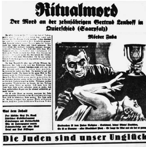
Figure 6.2 The Nazis revived and vigorously inculcated anti-semitic stereotypes. This front page of the propaganda newspaper Der Stürmer ( The Attacker ) depicts innocent Aryan womanhood being ritually murdered ( Ritualmord ) and drained of blood by the demonic Jewish male.