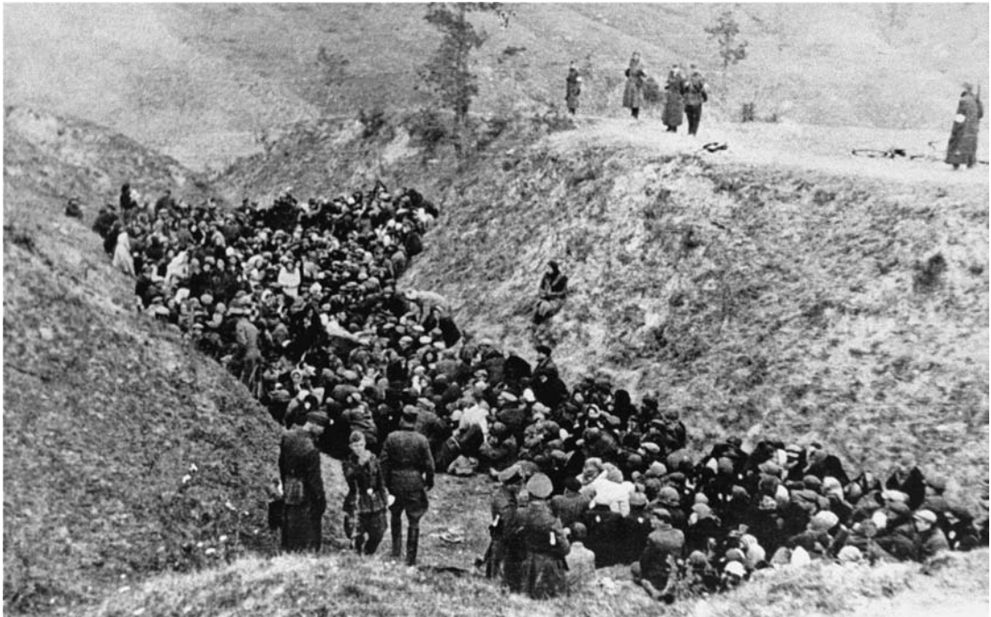
Figure 6.4 Soviet Jews gathered in a ravine prior to their mass execution by Einsatzgruppen killing units during the “Holocaust by Bullets,” 1941–42.

The role of the regular German army, or Wehrmacht , in this eruption of full-scale genocide was noted at the Nuremberg trials of 1945–46 (see Chapter 15). However, in part because the Western allies preferred to view the Wehrmacht as gentlemanly opponents, and subsequently because the German army was reconstructed as an ally by both sides in the Cold War, a myth was cultivated that the Wehrmacht had acted “honorably” in the occupied territories. Scholarly inquiry has now demonstrated that this is “a wholly false picture of the historical reality.” 28 Permeated to the core by the Nazis’ racist ideology, the Wehrmacht was key to engineering the mass murder of