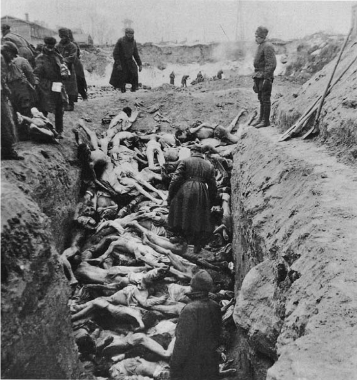
Figure 6A.3 Mass grave of Soviet prisoners, 1941–42. “The photos . . . were found by chance during a search action. They are from the widow of a member of Landeschützenbataillon 432, which guarded the Dulag [= Durchgangslager , transit camp for POWs] 121 in Gomel . . . The photo in all probability shows a scene from the huge mass dying of the prisoners of war” (holocaustcontroversies.blogspot.com).

Source: Klaus-Michael Mallmann et al. , eds, Deutscher Osten 1939–1945: Der Weltanschauungskrieg in Photos und Texten (Darmstadt: Wissenschaftliche Buchgesellschaft, 2003).