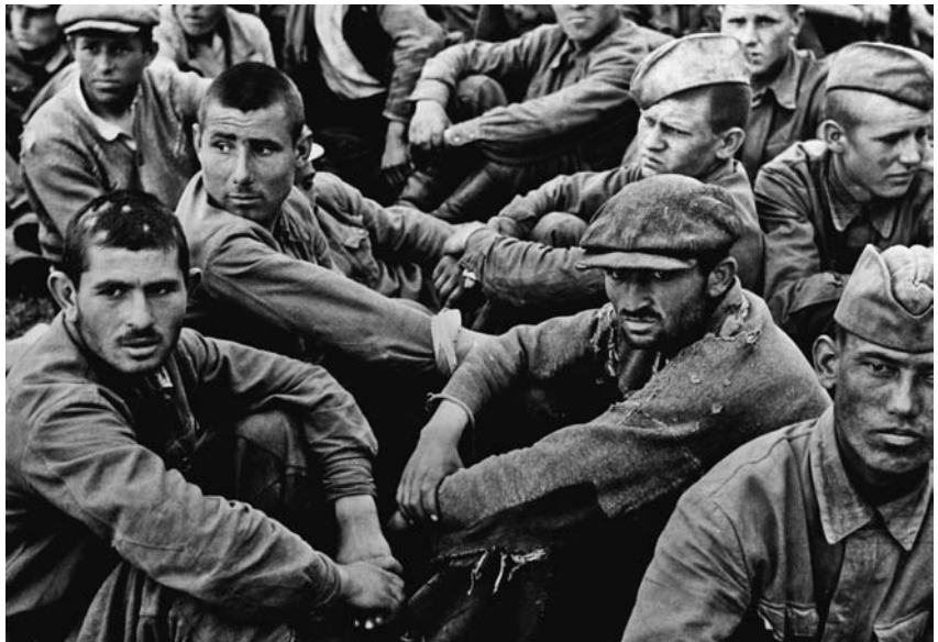
Figure 6A.2 Soviet prisoners-of-war await their fate in Nazi captivity, summer or autumn 1941.

A Hungarian tank officer who visited one POW enclosure described “tens of thousands of Russian prisoners. Many were on the point of expiring. Few could stand on their feet. Their faces were dried up and their eyes sunk deep into their sockets. Hundreds were dying every day, and those who had any strength left dumped them in a vast pit.” 49 German guards took their amusement by “throwing a dead dog into the prisoners’ compound,” citing an eyewitness