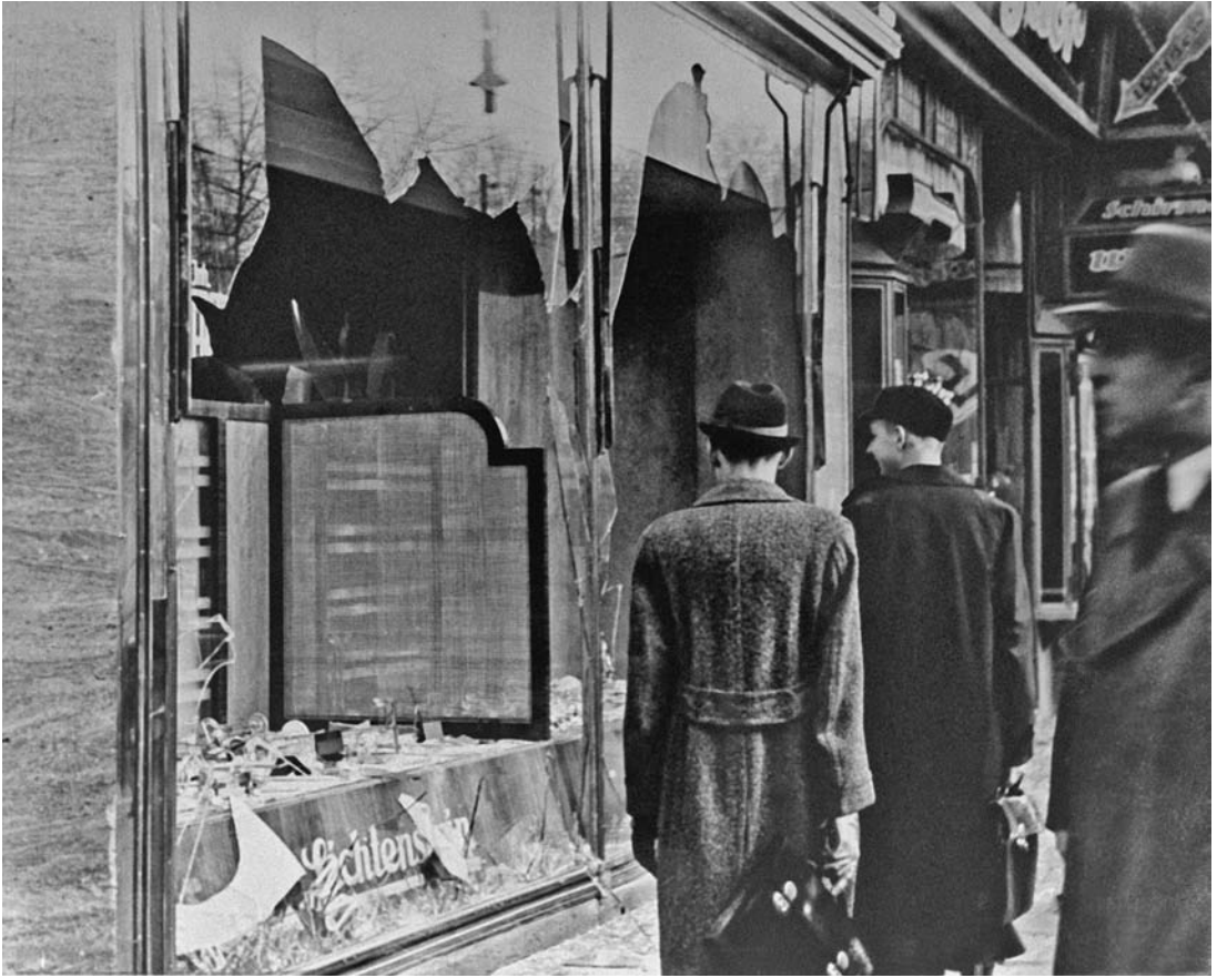
Figure 6.3 “Germans pass by the broken shop window of a Jewish-owned business that was destroyed during Kristallnacht,” Berlin, November 10, 1938. While many Germans strongly supported the Nazis’ anti-semitic policies, many also bridled at the violence of the “Night of Broken Glass,” and the “un-German” disorder it typified. The Nazis monitored public opinion carefully, and such sentiments prompted them, when the time came to impose a “final solution of the Jewish problem,” to “outsource” the mass extermination process to the occupied territories in Poland and the USSR.