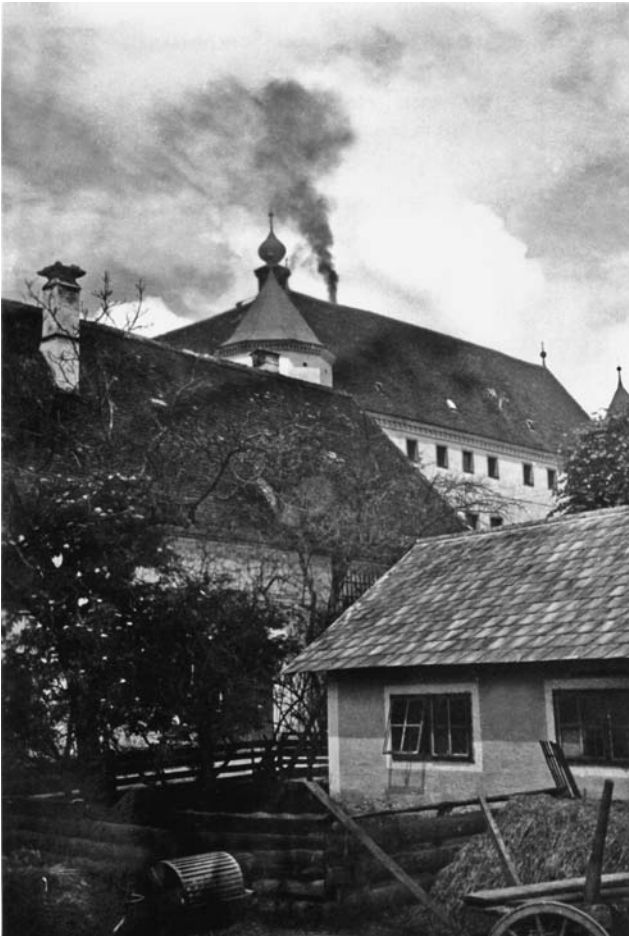
Figure 6A.1 A farmer took this clandestine photo of smoke billowing from the crematorium chimney of the Schloss Hartheim killing complex in Germany, as Aktion (Operation) T-4 – the mass murder of the handicapped – was underway in 1940–41. Hartheim was one of six main facilities for the Nazi “euthanasia” campaign, which served as a trial run for the Holocaust, including the use of gas chambers to kill victims.

Predictably, then, mass murder in the eastern occupied territories also targeted the handicapped. “In Poland the Germans killed almost all disabled Poles . . . The same applied in the occupied Soviet Union.” 35 With the assistance of the same Einsatzgruppen death squads who murdered hundreds of thousands of Jews in the first year of the war, some 100,000 people deemed “unworthy of life” were murdered at a single institution, the Kiev Pathological Institute in Ukraine. 36 In all, perhaps a quarter of a million handicapped and disabled individuals died to further the Nazis’ fanatical social-engineering scheme.